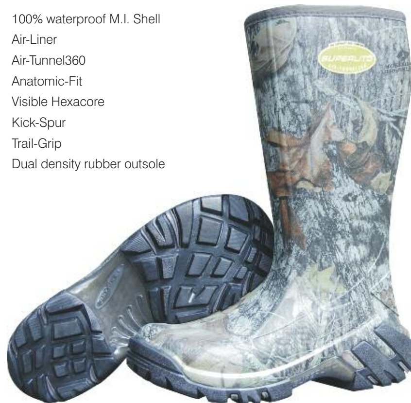
SPR-CMOH Sport High

gender unisex colour mossy oak camo sizes UK 4-13