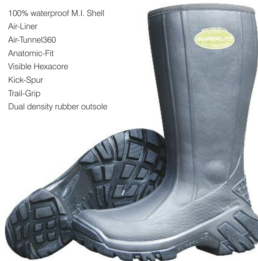
SPR-998H Field High