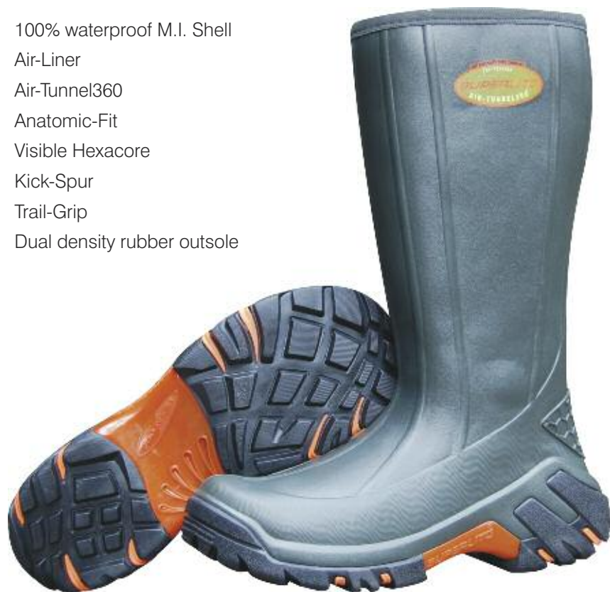
SPR-333H Stream High

gender unisex colour moss/orange sizes UK 4-13